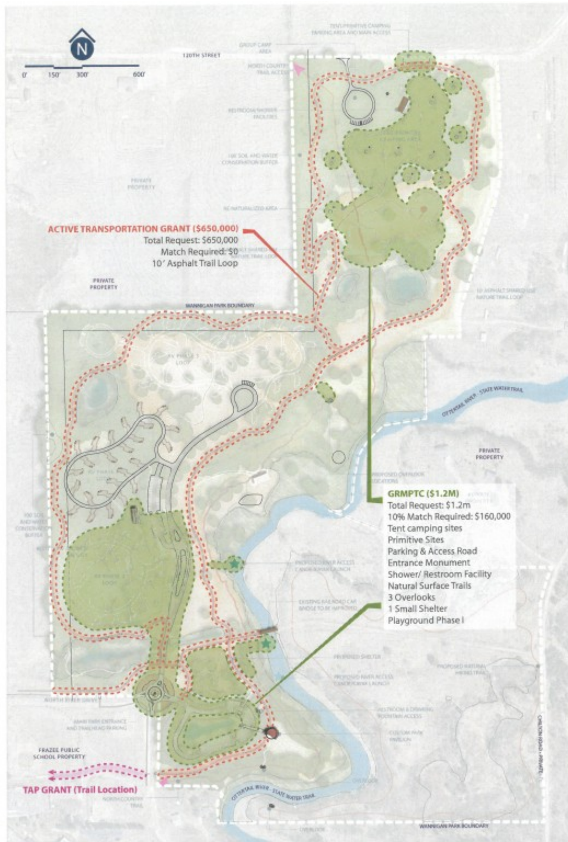
Wannigan Park Funding Breakdown | Frazee, MN | October 2024