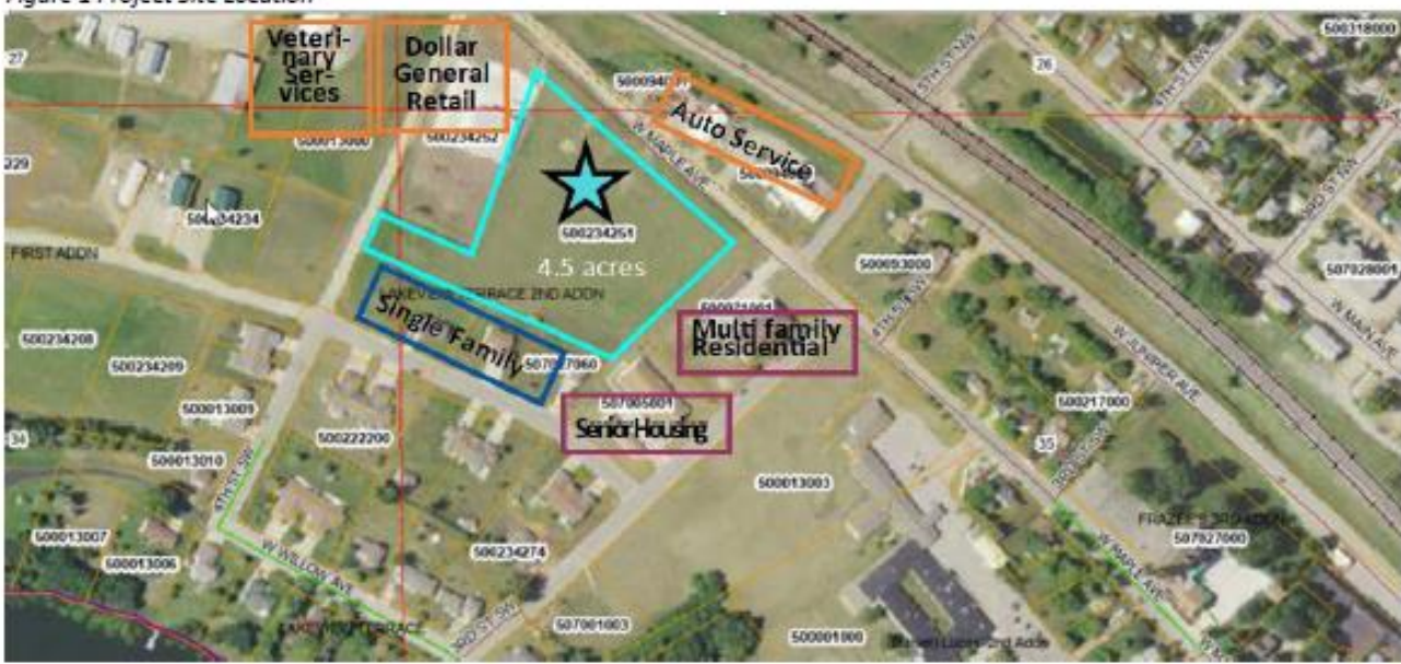
Figure 2: Enlarged view of the site