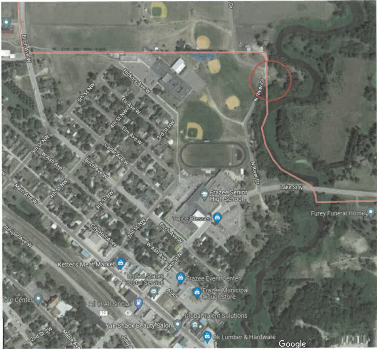
NORTH RIVER DRIVE PRIMITIVE CAMP SITE