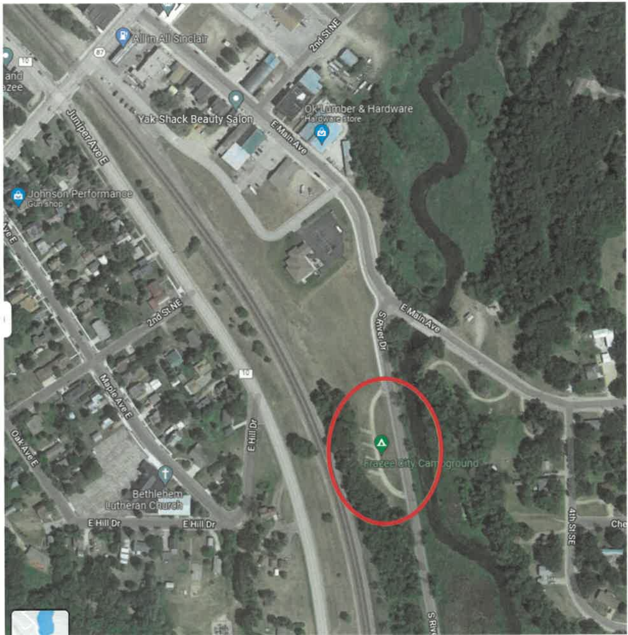
South River Drive Full RV Hook Up Campsite