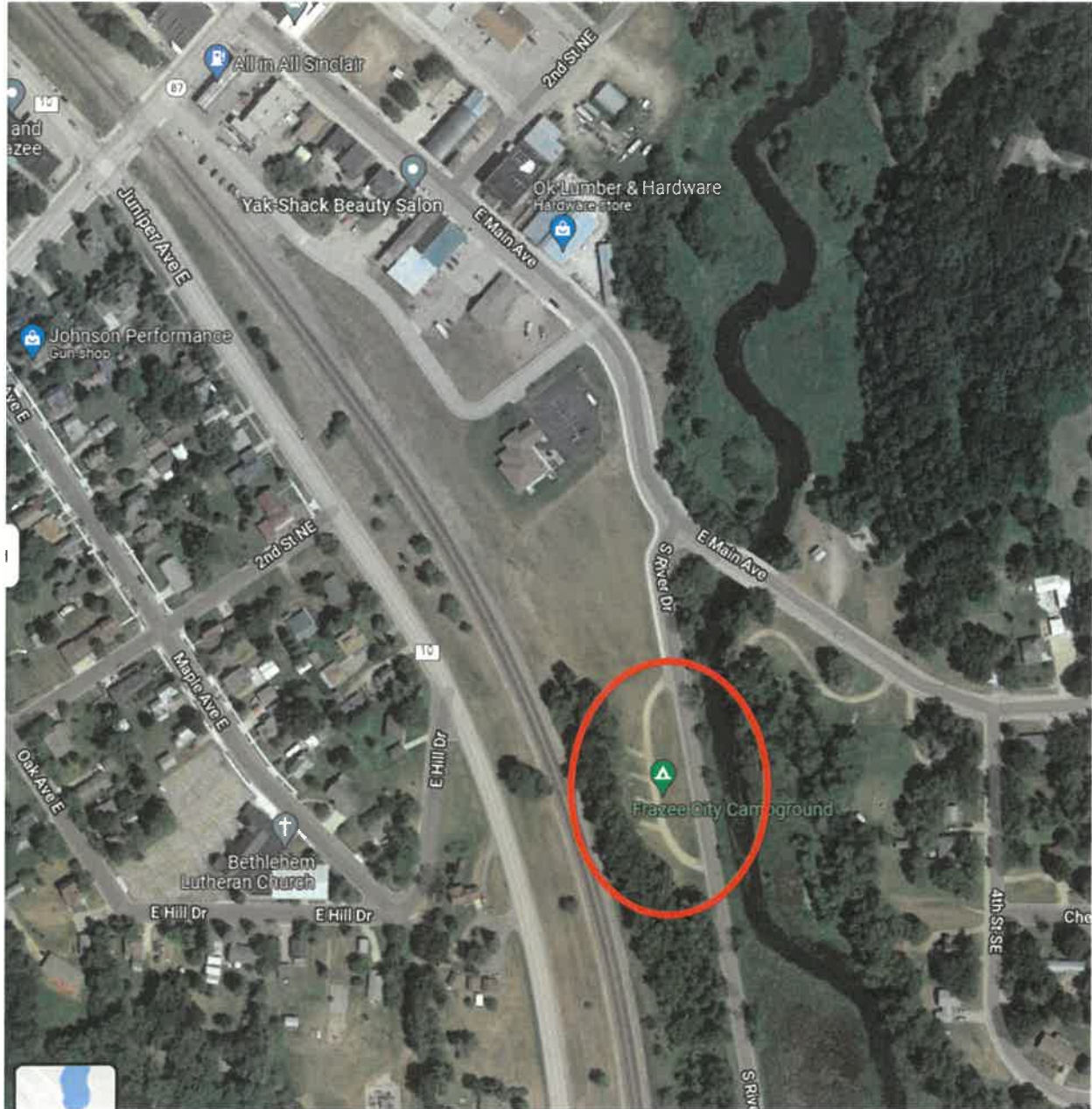
South River Drive Full RV Hook Up Campsite