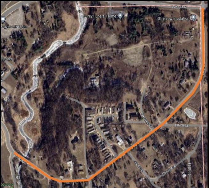
Reconstruction of East Main