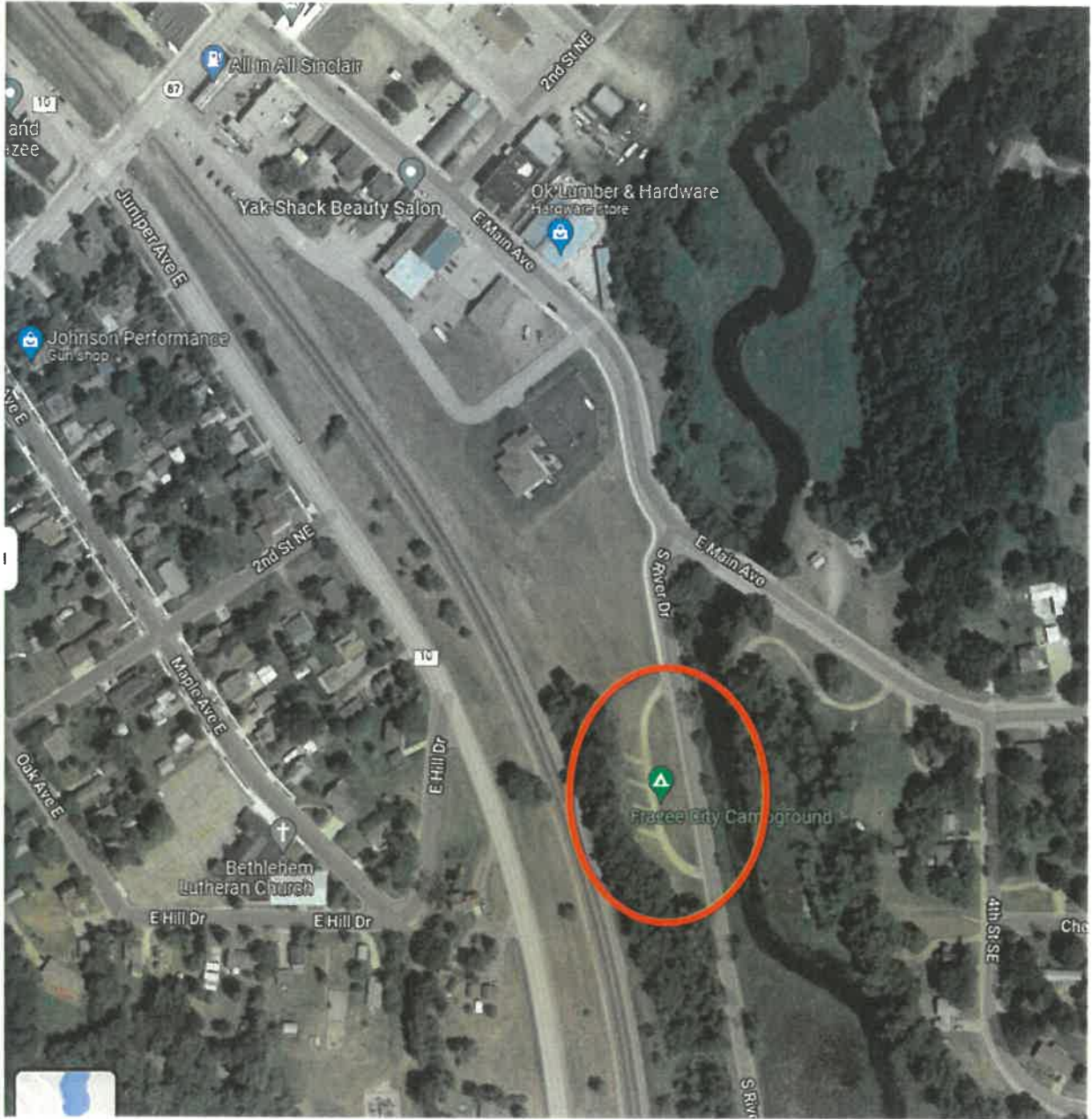
South River Drive Full RV Hook Up Campsite